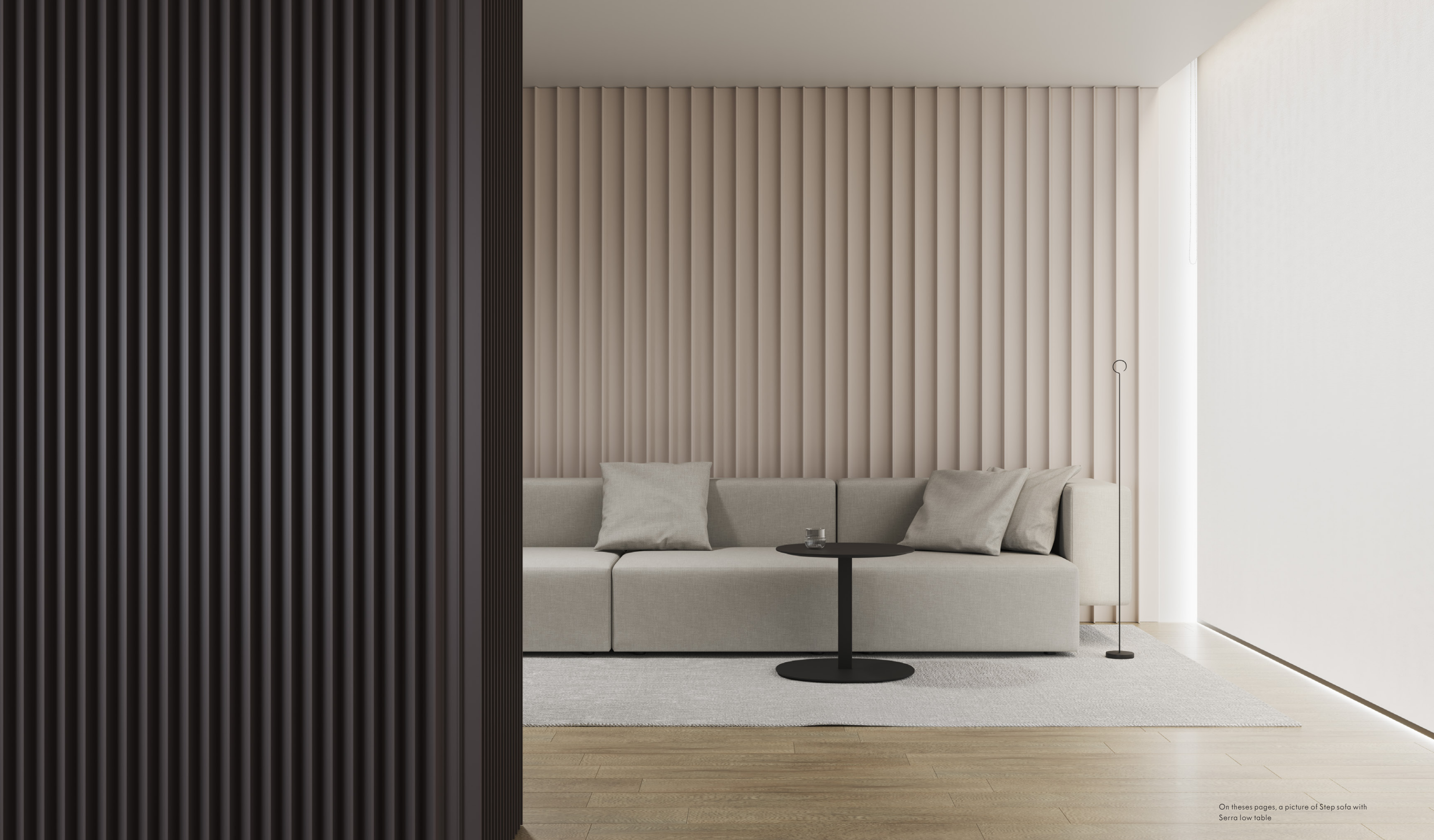
On these pages, a picture of Step sofa with Serra low table