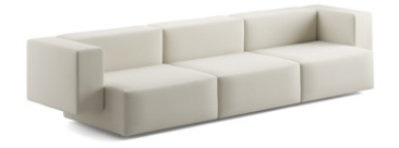
Step sofa, Composition 3