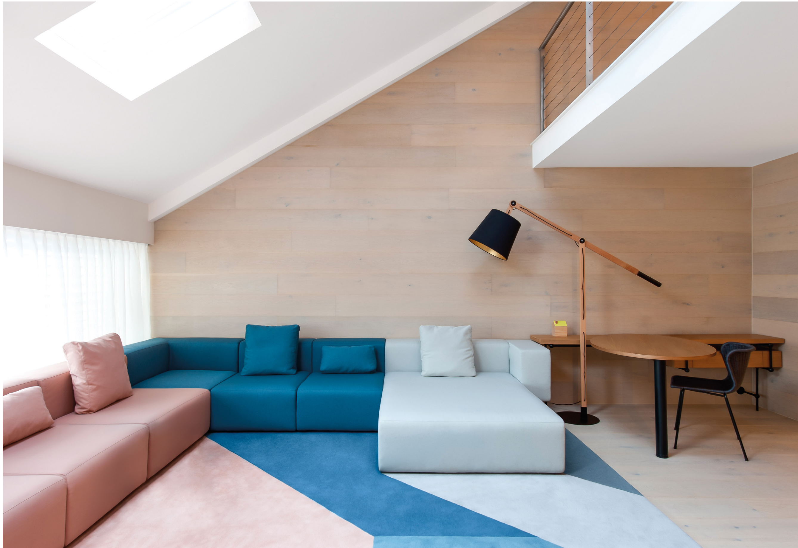
Project: The Ovolo Woolloomollo Hotel Interior design: HASSELL