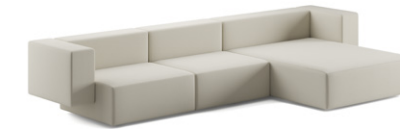
Step sofa, Composition 5