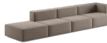
Step sofa, Composition 7