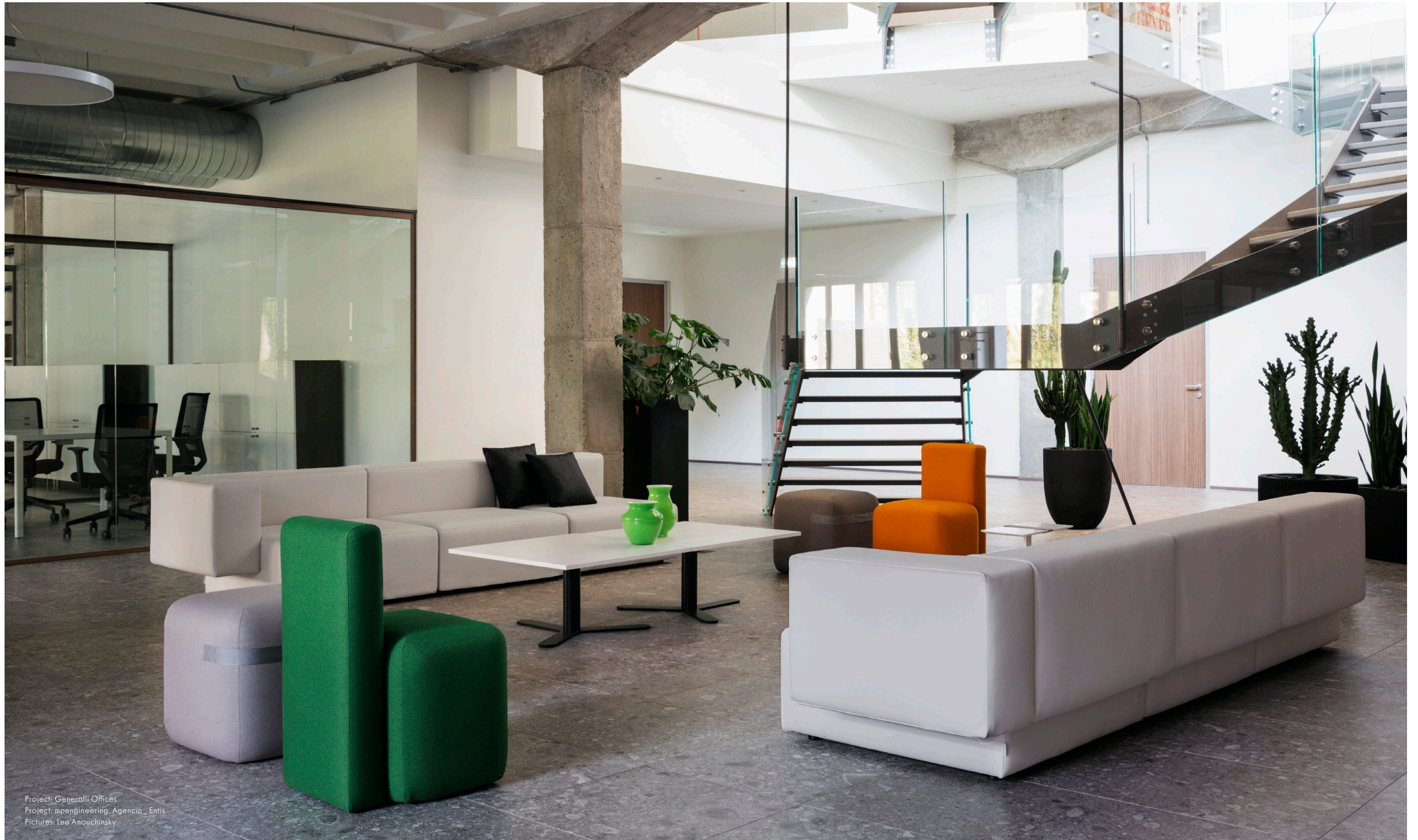
Project: Generali Offices Project: mpeengineering, Agencia _ Entis