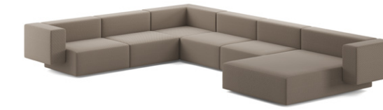
Step sofa, Composition 8