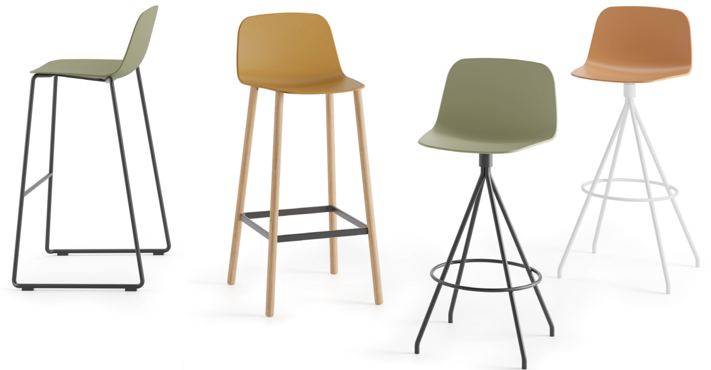
On the left, a picture of stacked sled base Maarten chairs and stools. On this page, Maarten Plastic stools

What would happen to the polypropylene seats if they did not include the stacking option? Maarten Plastic was born with the call of making everything easier, including the organization. You can stack up to 10 chair units thanks to its lightness and easy transportation.