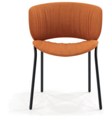
Funda chair 4 metal legs