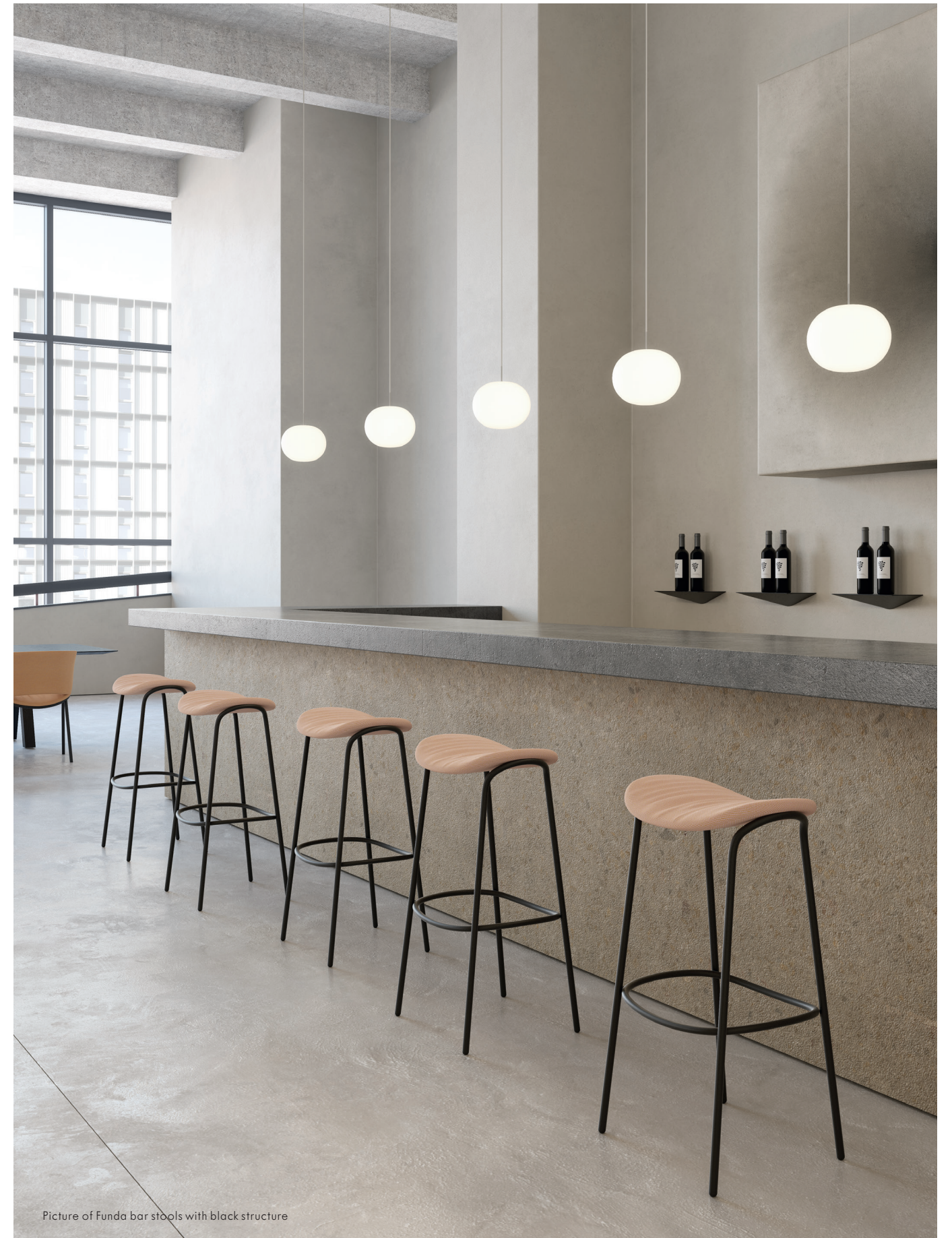
Picture of Funda bar stools with black structure