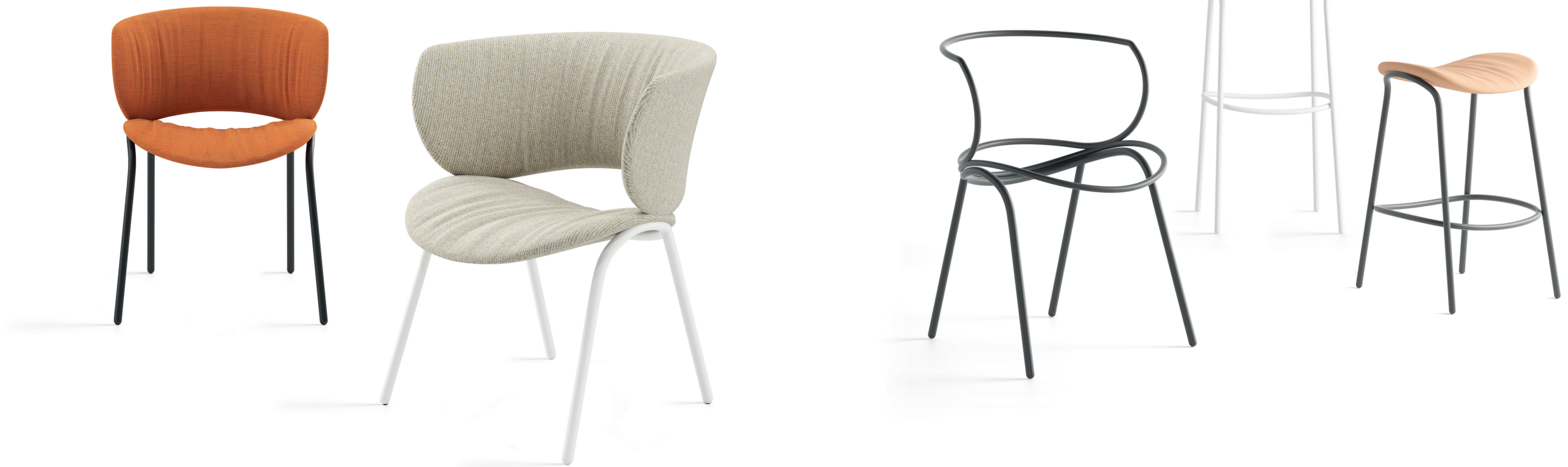
Funda family composed of a chair, a lounge chair and stools with bar and counter height in black and white structures

The commitment to maximum sustainability and comfort shapes Funda, a new range of seats conceived by the outstanding designer Stefan Diez.