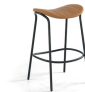
Funda counter stool metal legs