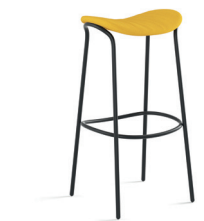
Funda bar stool metal legs