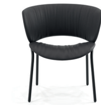
Funda armchair 4 metal legs