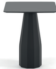
Burin H102 80x80 cm / H40.16" 31.50"x31.50"