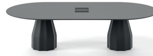
Burin double base H74 L240 cm / H29.13" L94.48" with powerbox