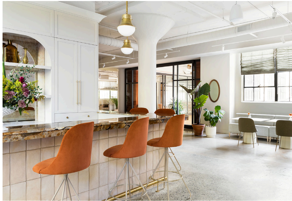
Project on the left page: HudCo Coworking Space, New York. Design: Christina Michelle Interiors.