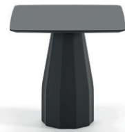
Burin H74 80x80 cm / H29.13" 31.50"x31.50"