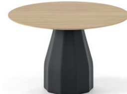
Burin H74 D120 cm / H29.13" D47.24"