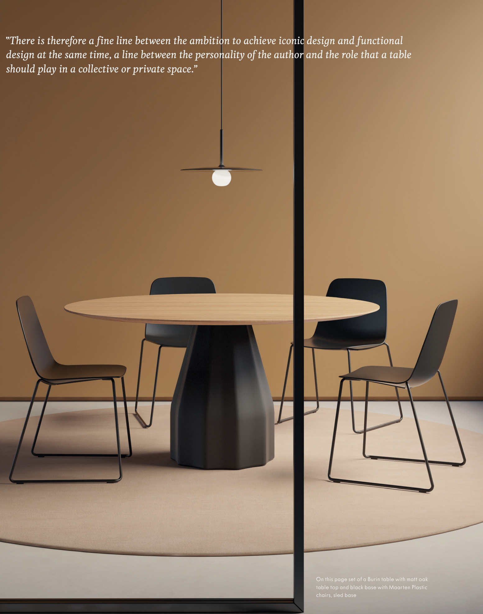
On this page set of a Burin table with matt oak table top and black base with Maarten Plastic chairs, sled base

“There is therefore a fine line between the ambition to achieve iconic design and functional design at the same time, a line between the personality of the author and the role that a table should play in a collective or private space.”