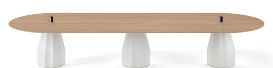
Burin triple base H74 L350 cm / H29.13" L889" with pop-up sockets