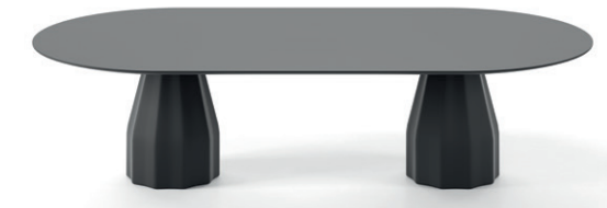
Burin double base H74 L240 cm / H29.13" L94.48"