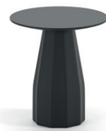
Burin H74 D70 cm / H29.13" D27.56"