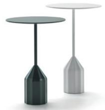
Burin Mini H50 - H55 cm / H19.69" - H21.95"