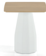
Burin H74 70x70 cm / H29.13" 27.56"x27.56"