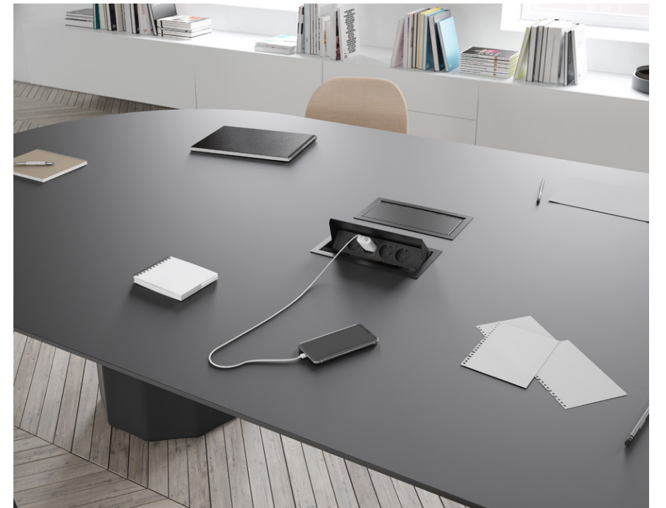
In these pages, a picture of Burin table with Aleta chairs