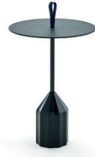
Burin Mini H50 + 10 cm (handle) / H19.69 + 3.94" (handle)

For more info: www.viccarbe.com/model/burin-table