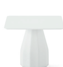
Burin H74 100x100 cm / H29.13" 39.37"x39.37"