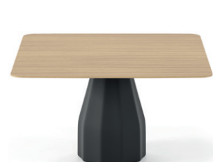
Burin H74 140x140 cm / H29.13" 55.11"x55.11"