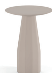
Burin H102 D80 cm / H40.16" D31.50"