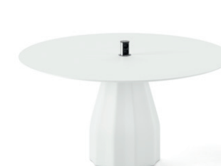
Burin central base H74 D150 cm / H29.13" D59.05" with pop-up sockets