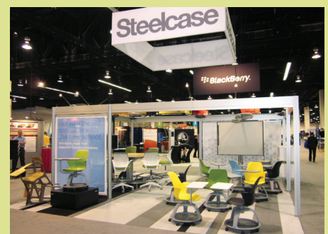
Steelcase will be participating at the EDUCAUSE Annual Conference as an exhibitor as well as helping EDUCAUSE create its Flexible Learning Space for CIOs and senior IT leaders.

For more information on EDUCAUSE, visit: http://www.educause.edu .