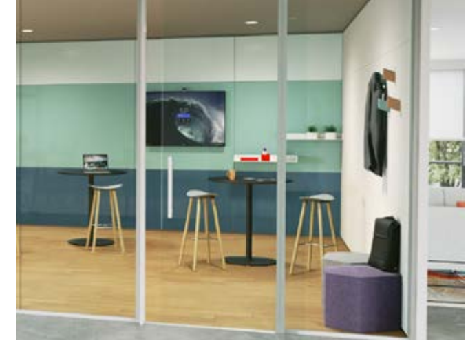
07 Large Meeting Room