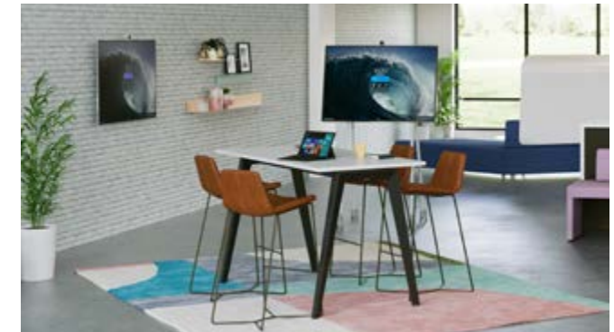
08 Social Commons