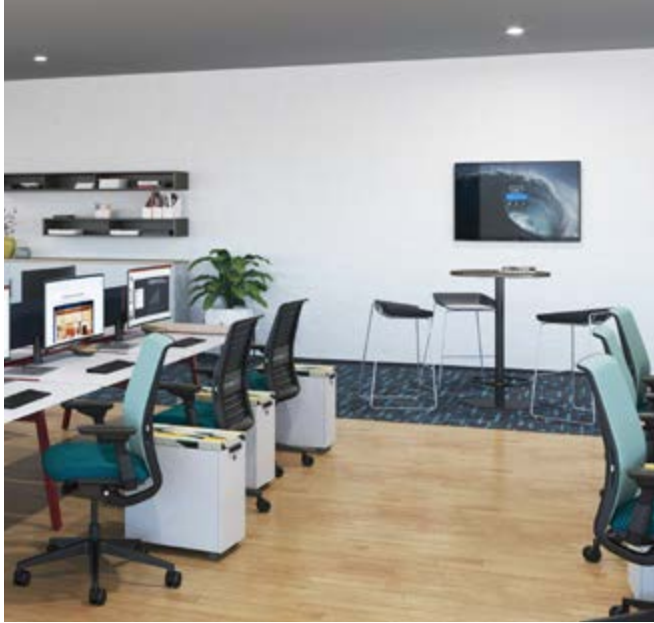
01 Department Team Open Plan