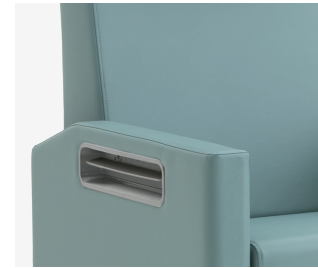
Back recline paddle