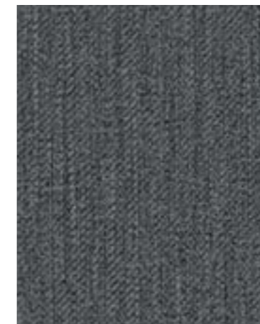
Darkest Grey 5H50