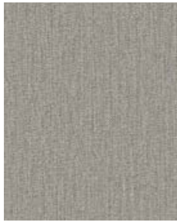
Light Mocha 5H39