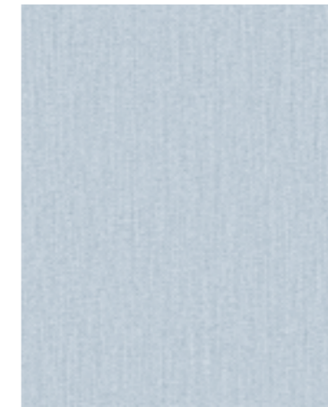
Ice Blue 5H48