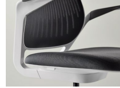
270° Flexible Seat Edge Encourages you to move and shift, allowing you to sit centered or off to the sides.