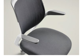
Soft Arm Caps The arms are integrated into the back frame to accommodate side sitting.