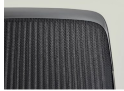
Flexible Top Edge Lets you comfortably rest your arm on top of the chair.