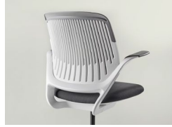
Flexing Back Design The flexing back contours to support any posture your body needs at any given moment.