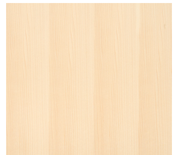
Clear Maple 3222 Quarter Cut