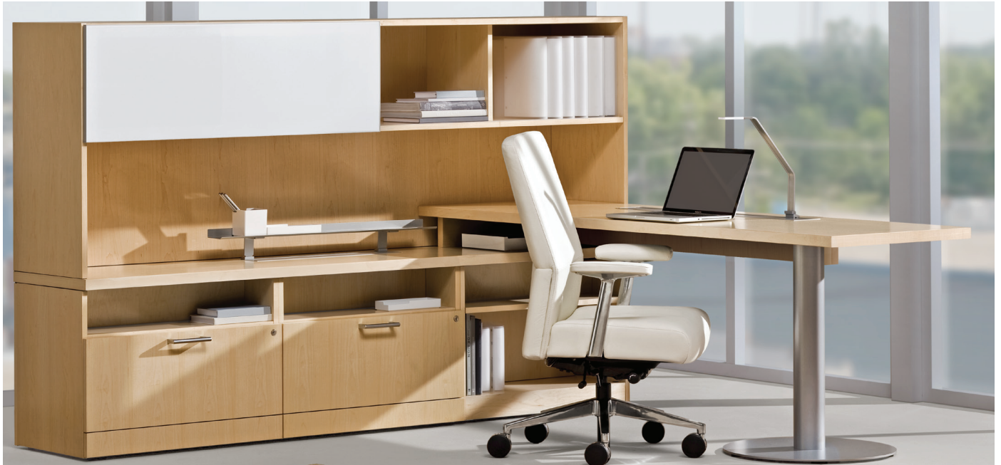
3522 Clear Maple in application.

3222 Quarter Cut Open Pore / 3224 Quarter Cut Full Fill