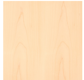
Clear Maple 3522 Flat Cut

Wood will age and lighten or darken as it goes through a natural maturation process. Color changes occur because wood is an organic material. The rate and degree of color change depends on the species of the tree, its growing conditions, and the conditions of the environment it is exposed to after being made into furniture. Direct and constant sunlight (natural or synthetic) will age any wood product.