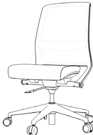
Mesh Back Armless