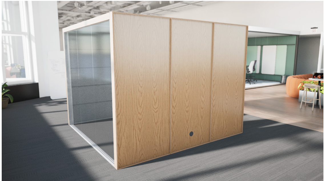
Air25W – Back View

Launched in 2014, Orangebox's award-winning Air 3 acoustic pod range can act as a freestanding meeting room, private space, phone booth or touchdown room.