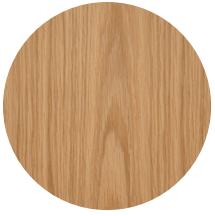
336D | Customiz Stain – Clear Coat Flat Cut Oak