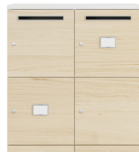
Letter Slot + Card Holder