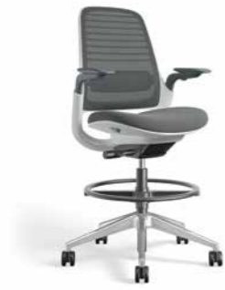
Stool Height Weight activated or Synchronised Mechanism