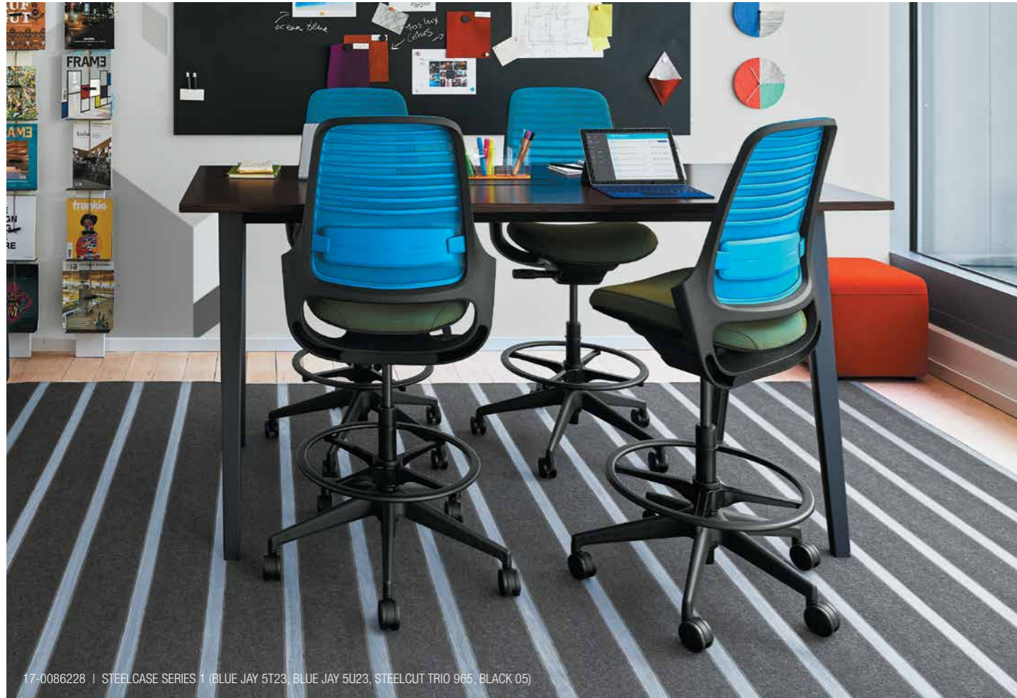
17-0086228 | STEELCASE SERIES 1 (BLUE JAY 5T23, BLUE JAY 5U23, STEELCUT TRIO 965, BLACK 05)

Series 1 offers 11 mix-and-match knit, flexor and lumbar colour options, and a wide range of finish options that enable organisations to express their brand in a way that best represents them. Plus, it's available in standard and draughtsman height. Headrest and coat hanger are in option to support a wide range of tasks and workstyles.