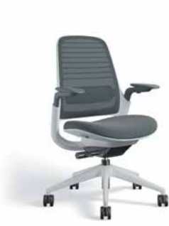
Standard Height Weight activated or Synchronised Mechanism