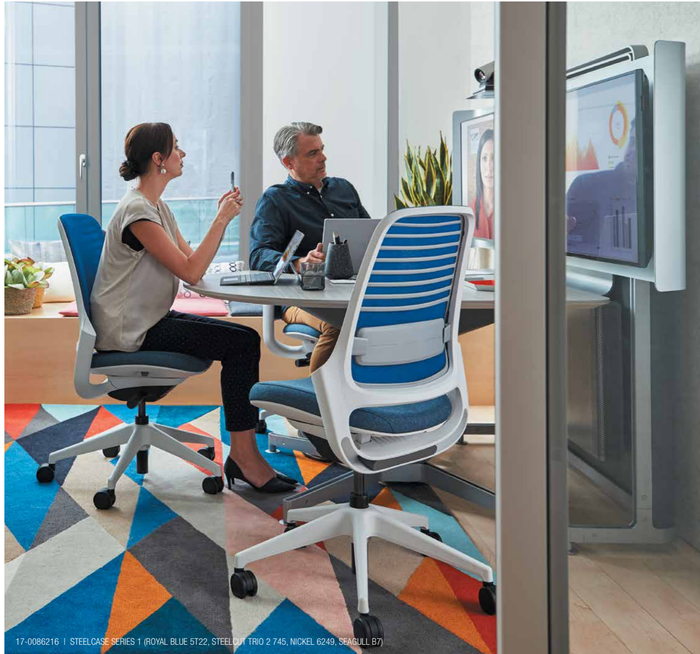
17-0086216 | STEELCASE SERIES 1 (ROYAL BLUE 5T22, STEELCUT TRIO 2 745, NICKEL 6249, SEAGULL B7)

Series 1 was thoughtfully designed with the performance you've come to expect from Steelcase. Series 1 delivers dynamic performance without sacrificing affordability.