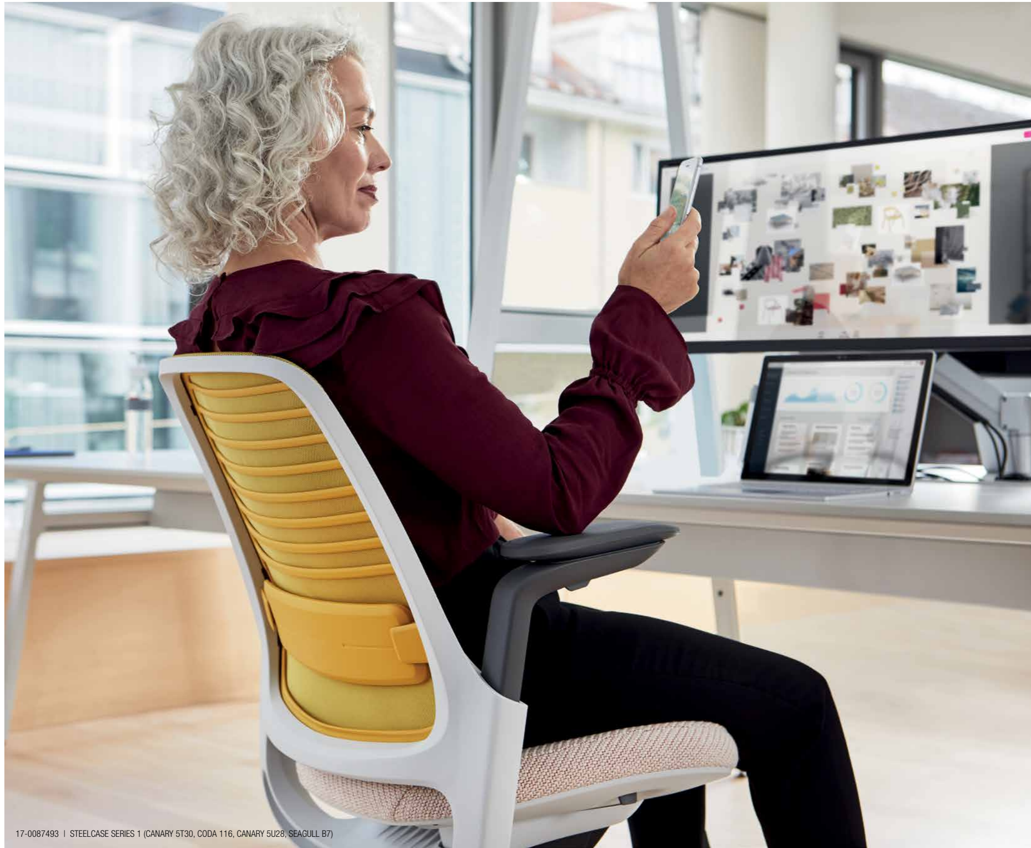
17-0087493 | STEELCASE SERIES 1 (CANARY 5T30, CODA 116, CANARY 5U28, SEAGULL B7)