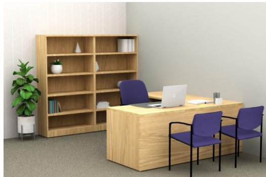
PRIVATE OFFICE 2

$3,100 Desk Leap Chair Bookcase Guest Chairs