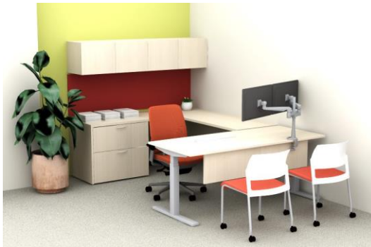
PRIVATE OFFICE 1

$4,400 Height Adjustable Desk Amia Task Chair Guest Chairs Storage