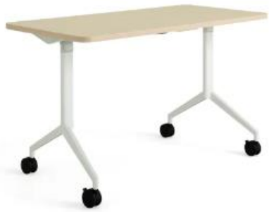
VERB FLIP TOP