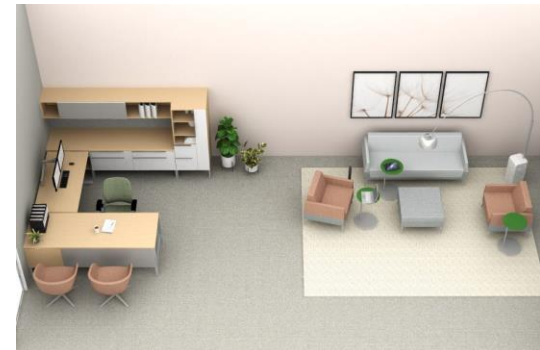
PRIVATE OFFICE 3

$34,000 Executive desking Lounge Thread Storage Accessories