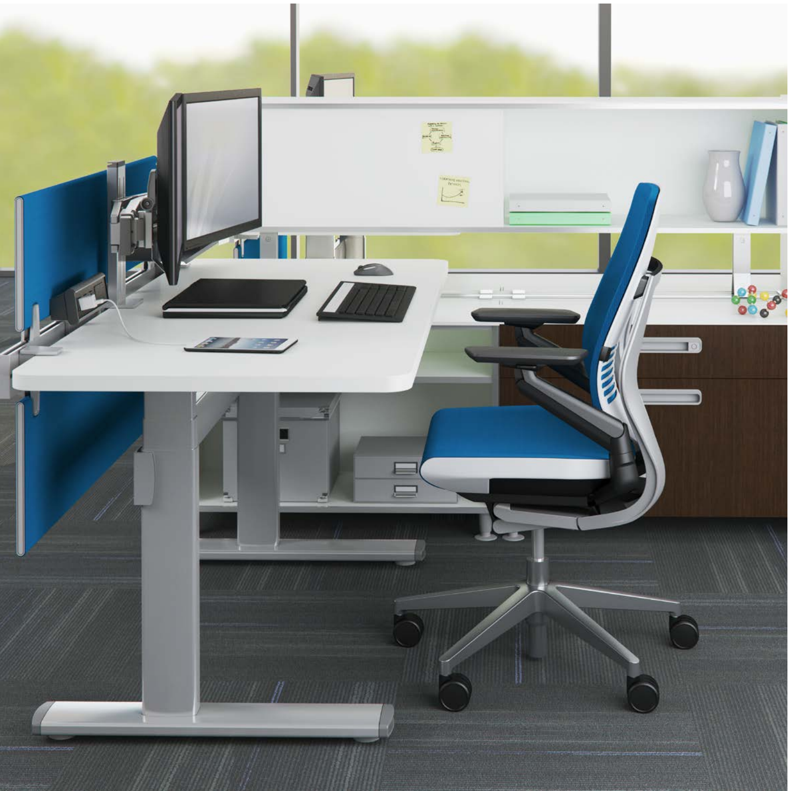
Series 7 enhanced sit-to-stand height-adjustable tables