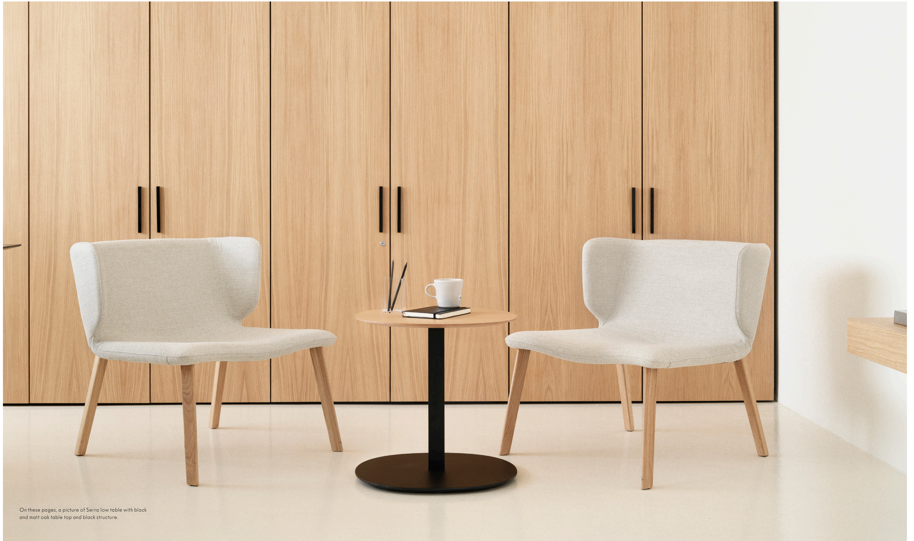
On these pages, a picture of Serra low table with black and matt oak table top and black structure.