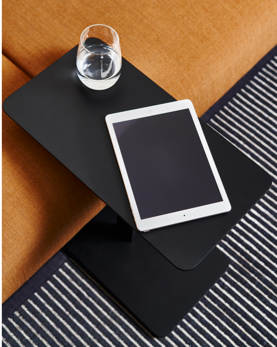
On the left, a picture of Serra low table in black finish. On the right, Serra table with white table tops and black structure.