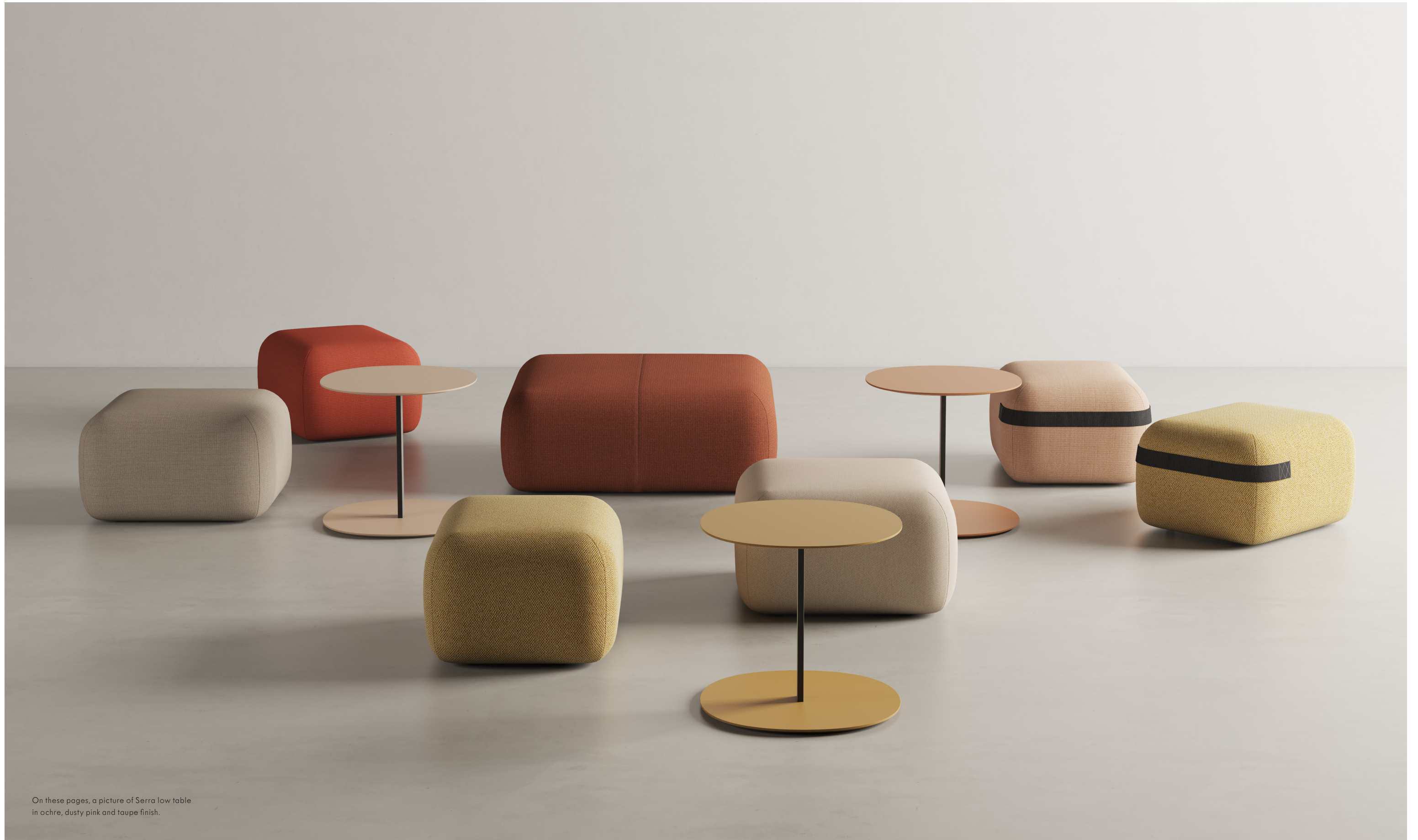
On these pages, a picture of Serra low table in ochre, dusty pink and taupe finish.