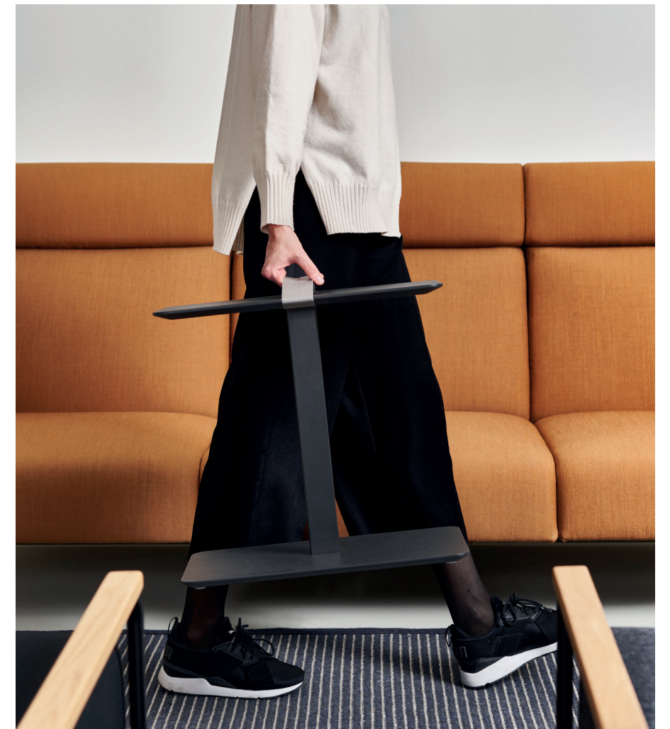
On the right, a picture of Serra low table with rectangular top full black and gray strap

Serra is a very suitable side table when it comes to complementing other pieces such as sofas, armchairs or poufs. It is a great accessory for the home or for the so-called in-between spaces. It is possible to choose between a rectangular or rounded surface, but also a wide range of finishes that will help fit in with all kinds of environments. In addition, the rectangular version offers the possibility of including a strap with which to easily transport the table.