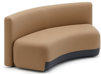
Model B - Closed