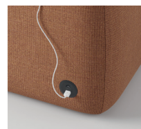
1. USB port, upholstery