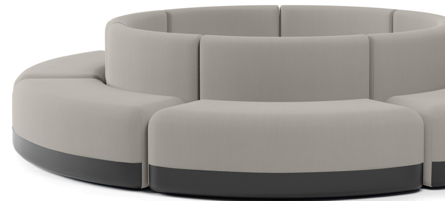
Pictures on the left & right page: closed Season Sofa. Straight, closed & open Season Sofa.