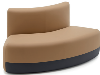
Model C - Open