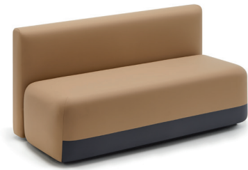
Model A - Straight