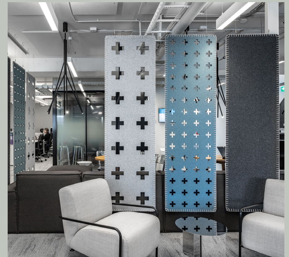
Project on the right: McDonald's HQ, Chicago Architecture & Interior Design: Sterling Bay +Gensler · IA Interior Architects y Studio O+A.