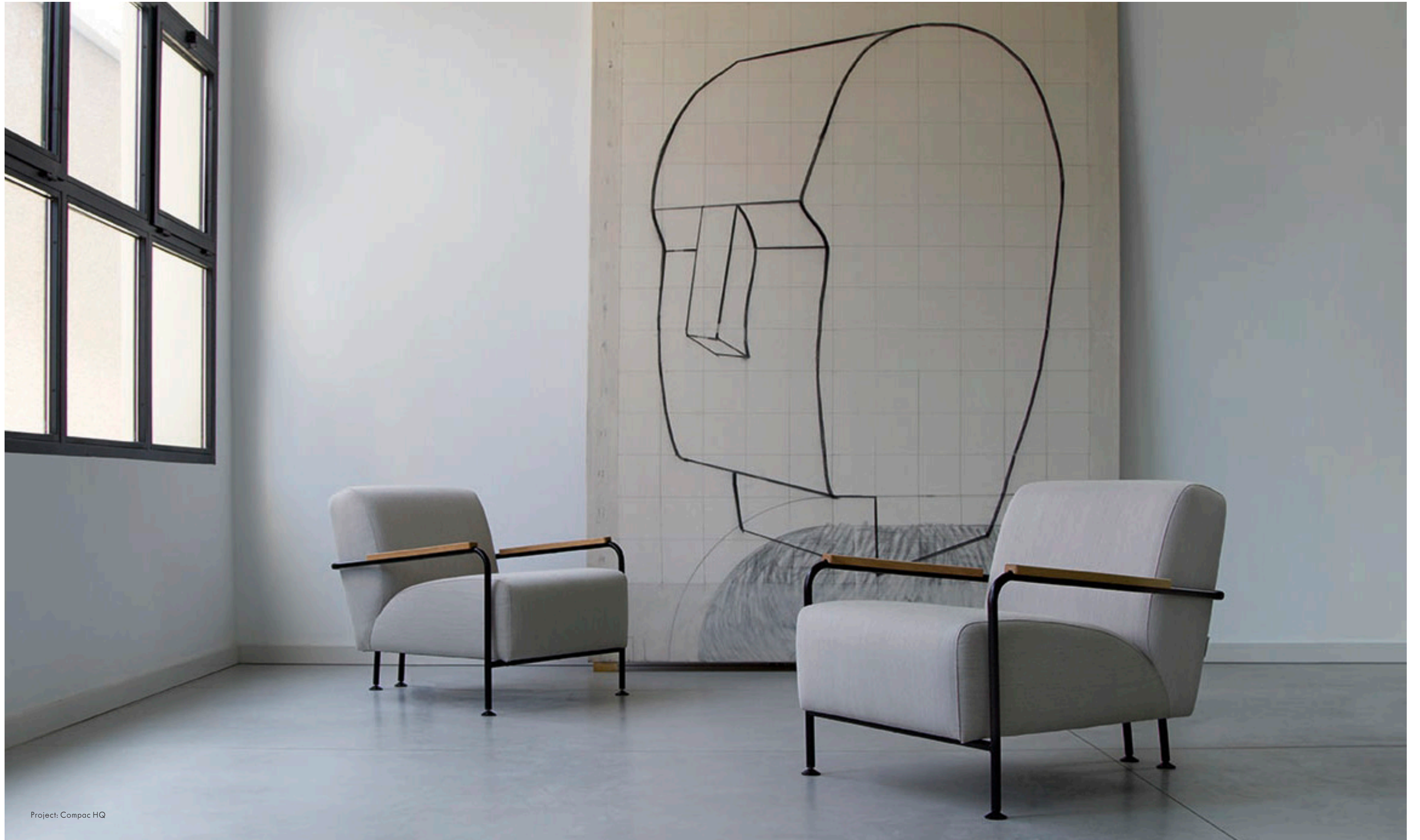
Project: Compac HQ