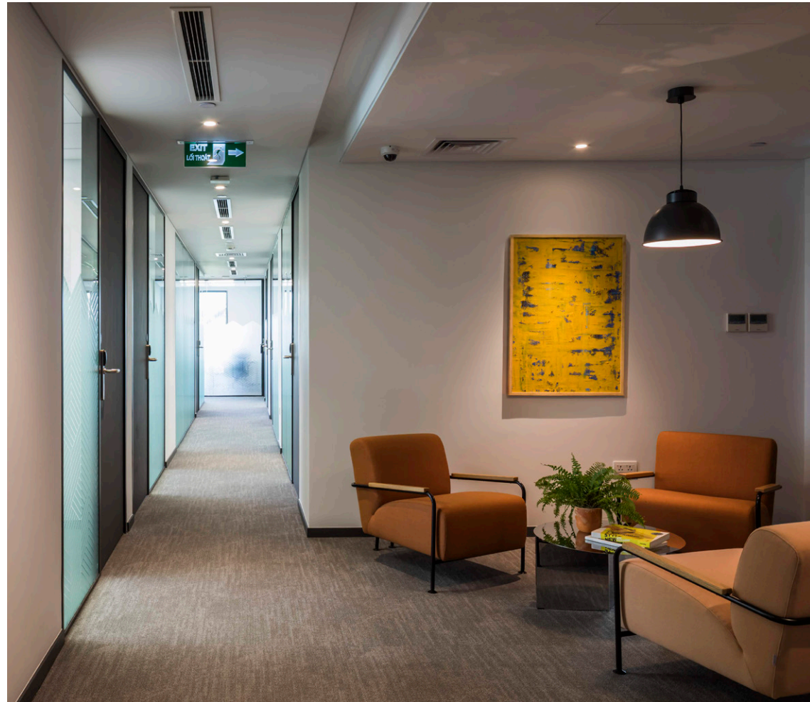
Project: Spaces Belvedere, Vietnam Interior design: Interior Architect_D&P Associates: Supplier_FacilityinQ