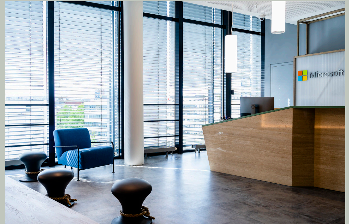
Project: Microsoft Office, Hamburg Interiors: Lepel & Lepel