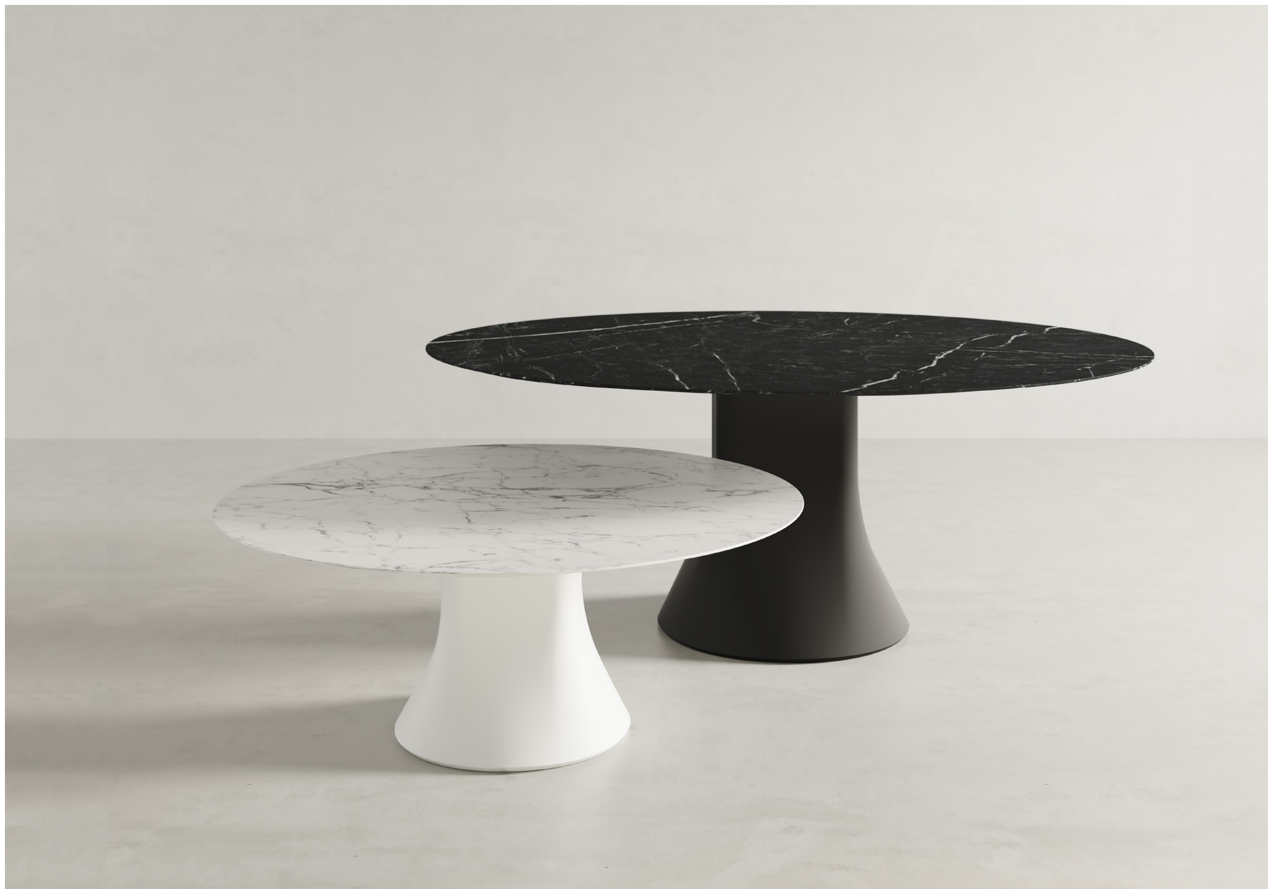
On these pages, featuring Cambio table H74cm | 29,13" Ø150cm | 59,05" tabletop in black marble and Cambio table H45cm | 17,71" Ø120cm | 47,24" tabletop in white marble.