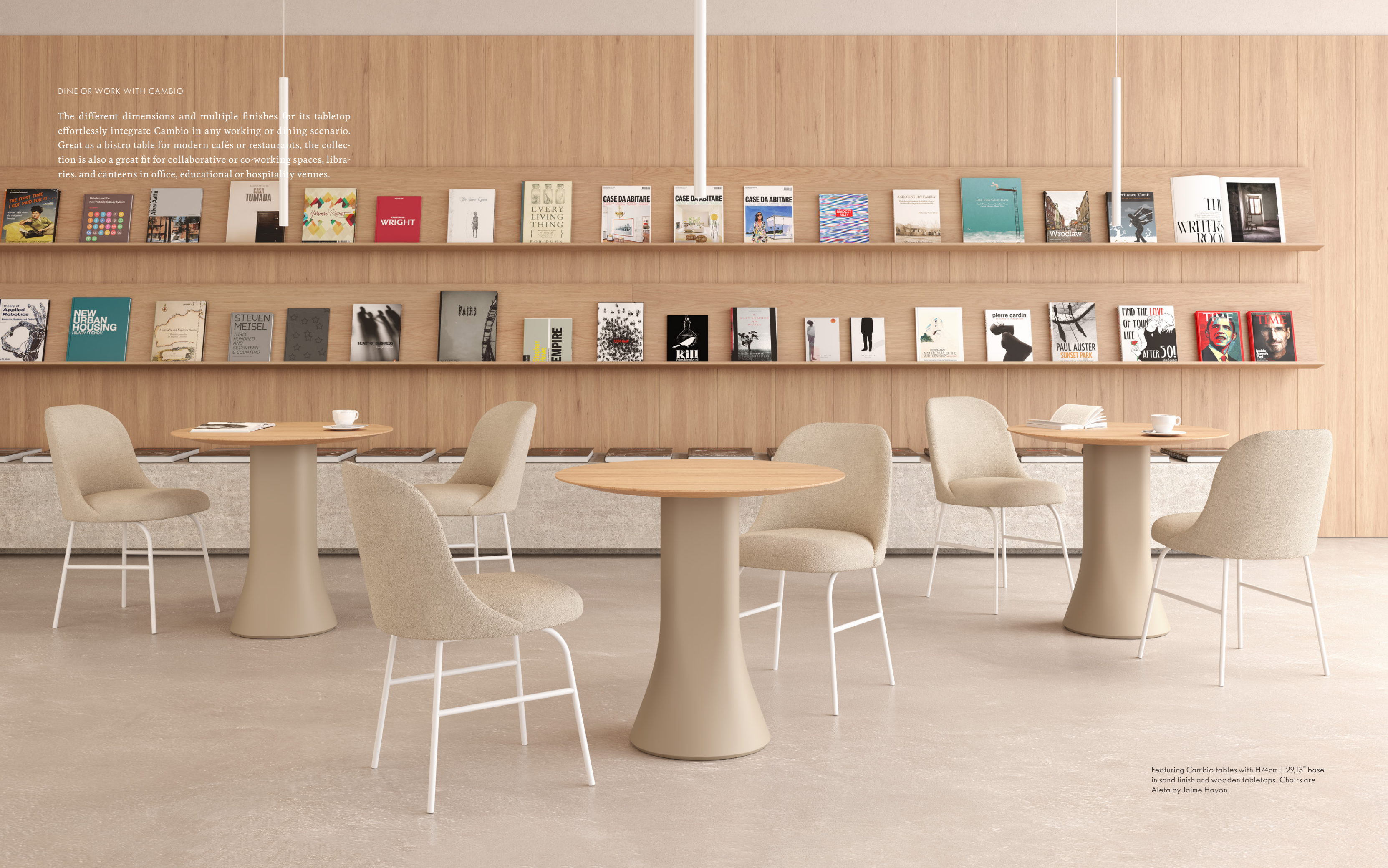
Featuring Cambio tables with H74cm | 29,13" base in sand finish and wooden tabletops. Chairs are Aleta by Jaime Hayon.

The different dimensions and multiple finishes for its tabletop effortlessly integrate Cambio in any working or dining scenario. Great as a bistro table for modern cafés or restaurants, the collection is also a great fit for collaborative or co-working spaces, libraries, and canteens in office, educational or hospitality venues.