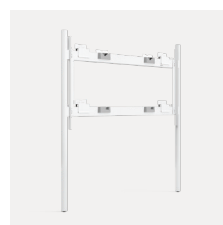
85" Floor Supported Wall Mount