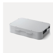
APC™ Mobile Charge Battery

*APC™ Charge Mobile Battery and Microsoft Surface Hub 2S devices sold separately.