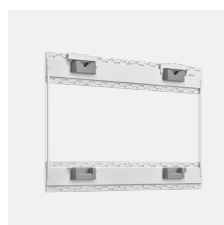
85" Wall Mount