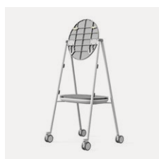
50" Mobile Stand