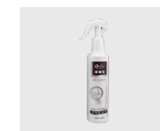
皮革柔性清洁水 250ml Leather Flexible Cleaner 250ml

轻易清除皮革表面的日常污渍，无需过水，不损皮质。滋养柔顺皮革，防止老化避免开裂。 Easy removal of daily stains on the leather surface, without water, without damage to the cortex. It nourishes soft leather, prevents aging and avoids cracking.