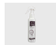
织物除渍剂 310ml Fabric Spot Cleaner

本产品独特的脱胶性能，有效地渗入污垢内部，解释污垢的胶合力，把污垢从织物纤维内部分离出来，高效清除残留在布面的污渍。 Complete environmentally products designd for cleaning all kinds common household stains when they happen from all fabric.