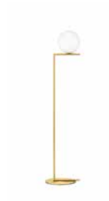
IC Lights F