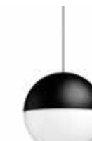
String Light Round*