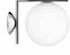
IC Lights C-W