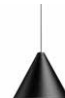
String Light Cone*