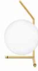
IC Lights T1 Low