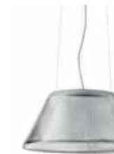
Romeo Moon S