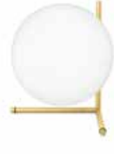
IC Lights T2