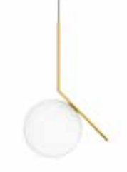
IC Lights S