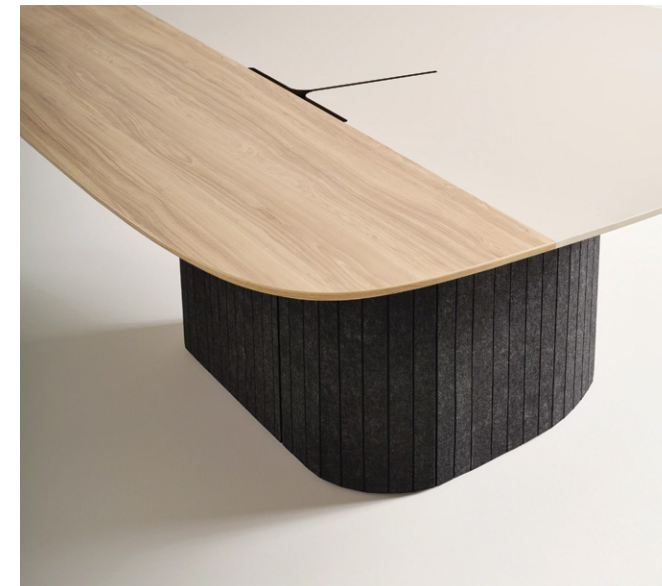
Ocular™ Steelcase Global Offer

Critical meetings need seamless connectivity. Our expertise, combined with solutions designed with world-renowned technology leaders, can help you create conference spaces where people can work better together.