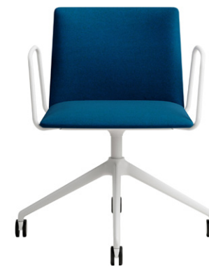
Stamp Collection Segis