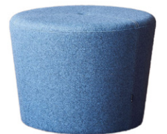
Lotus Pouf Collection Grado