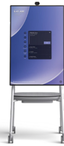
Steelcase Roam Collection Microsoft + Steelcase Global Offer

The versatile mobile stand, designed for Microsoft Surface Hub solutions, now supports Smart Rotation on the 50" Surface Hub 3—providing an easy transition between landscape and portrait modes.