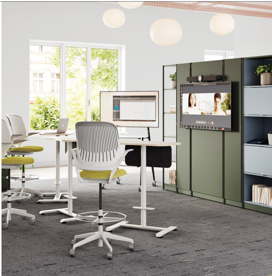
New! Steelcase Flex Active Frames Steelcase Global Offer

In the open plan, teams need the spatial flexibility to work independently or together, with high-performance technology to connect with others.