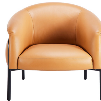
Belly Sofa Grado