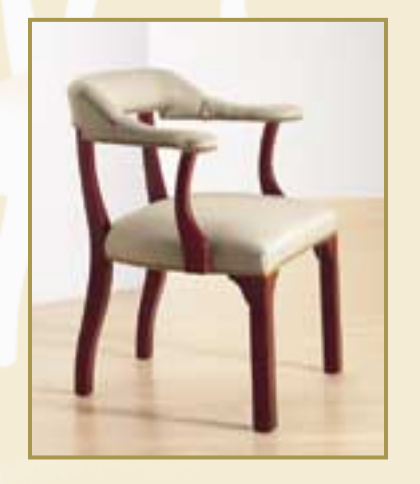
M A N S F I E L D^{\mathsf{m}}