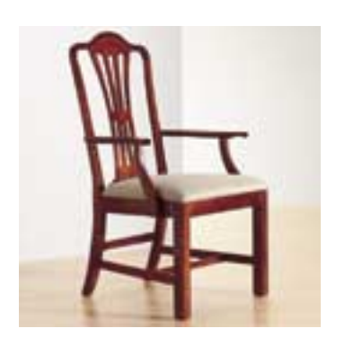
MANSFIELD GUEST CHAIR