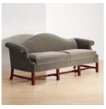
DEARBORN LOUNGE SOFA